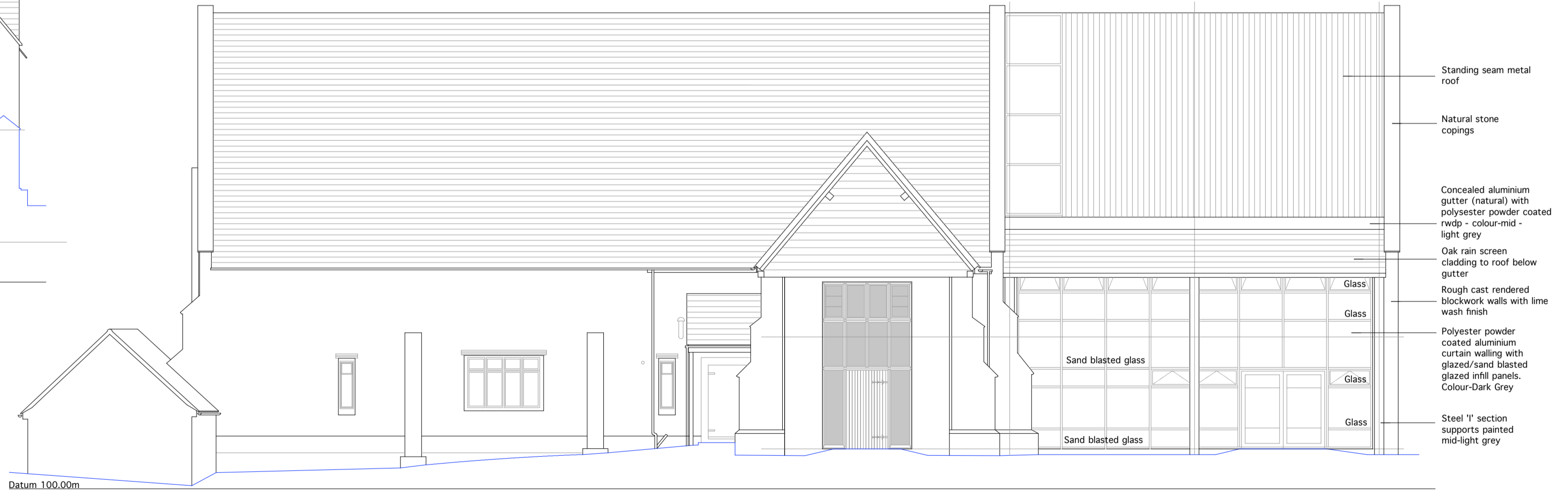
FRONT (WEST) ELEVATION Option 2